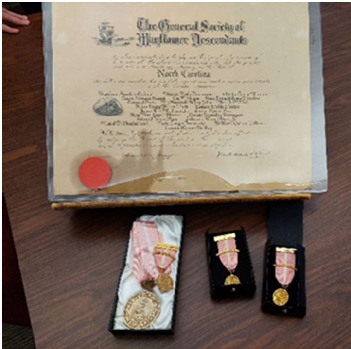
From: The Speedwell Colony Trip to the NC State Archives in 2022