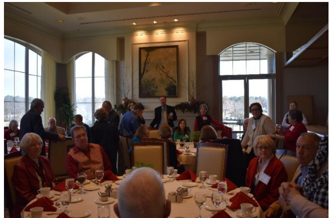
The Christmas Social at the Prestonwood Country Club